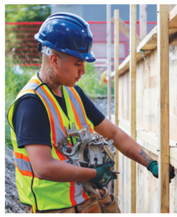
Construction work placement, Purpose Construction

"Our hamper recipients loved the cookies and curry lentil soups this year! Our participants packing the hampers are grateful for the honoraria we provide, offering that "little extra support."